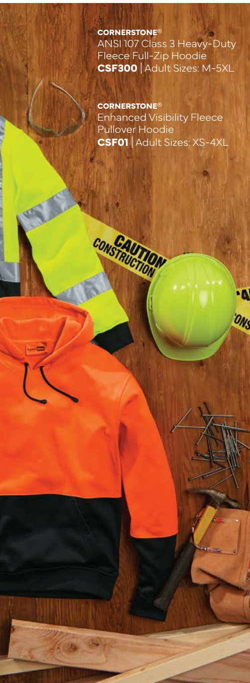
CORNERSTONE® ANSI 107 Class 3 Heavy-Duty Fleece Full-Zip Hoodie CSF300 | Adult Sizes: M-5XL