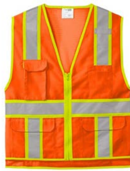
CORNERSTONE® ANSI 107 Class 2 Surveyor Zippered Two-Tone Vest CSV105 | Adult Sizes: S/M, L/XL, 2XL/3XL, 4XL/5XL