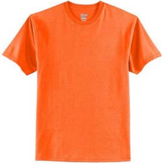
HANES® Authentic 100% Cotton T-Shirt 5250 | Adult Sizes: S-5XL