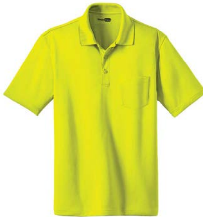
CORNERSTONE® Select Snag-Proof Pocket Polo CS412P | Adult Sizes: XS-4XL