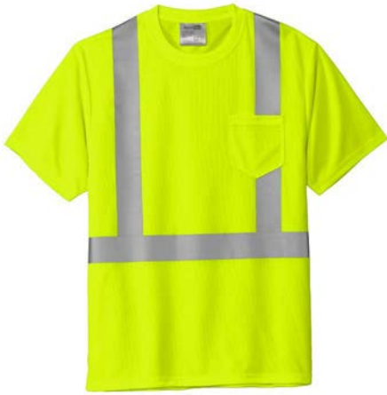
CORNERSTONE® ANSI 107 Class 2 Mesh Tee CS200 | Adult Sizes: S-5XL