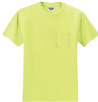
JERZEES® Dri-Power® 50/50 Cotton/ Poly T-Shirts 29M | 29B | Adult Sizes: S-5XL | Youth Sizes: XS-XL