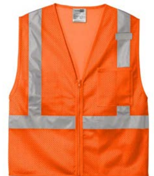
CORNERSTONE® ANSI 107 Class 2 Mesh Zippered Vest CSV102 | Adult Sizes: S/M, L/XL, 2XL/3XL, 4XL/5XL