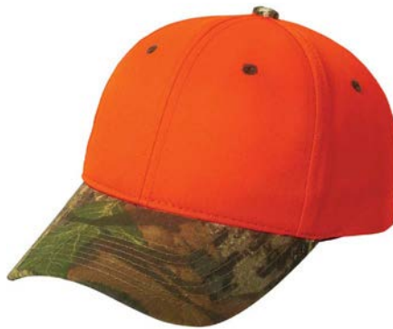
PORT AUTHORITY® Enhanced Visibility Cap with Camo Brim C804