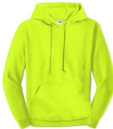
JERZEES® Super Sweats® NuBlend® Pullover Hooded Sweatshirt 4997M | Adult Sizes: S-3XL