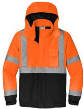
CORNERSTONE® ANSI 107 Class 3 Economy Waterproof Insulated Bomber Jacket CSJ500 | Adult Sizes: S-5XL