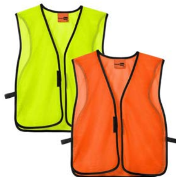
CORNERSTONE® Enhanced Visibility Mesh Vest CSV01 | One Size Fits Most