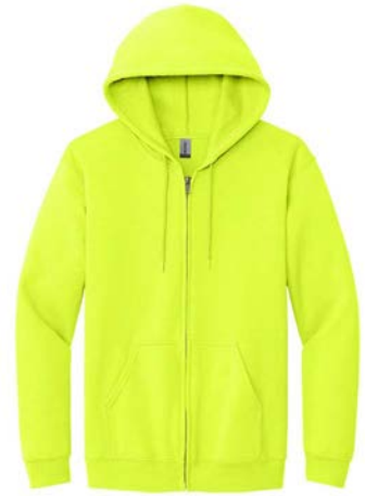
GILDAN® Heavy Blend™ Full-Zip Hooded Sweatshirt 18600 | Adult Sizes: S-5XL