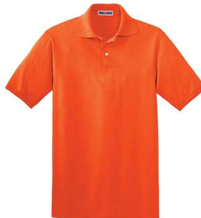
JERZEES® SpotShield™ 5.4-Ounce Jersey Knit Sport Shirt 437M | Adult Sizes: S-4XL