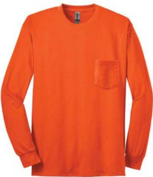
GILDAN® Ultra Cotton® 100% US Cotton Long Sleeve T-Shirt with Pocket 2410 | Adult Sizes: S-5XL