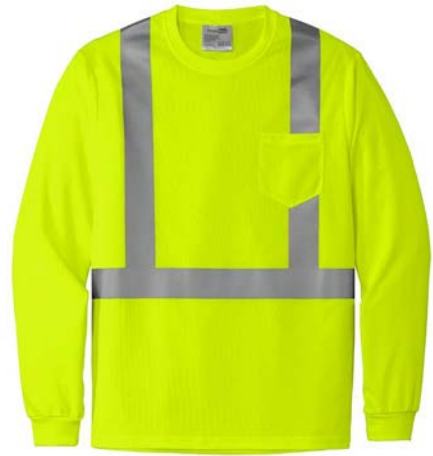
CORNERSTONE® ANSI 107 Class 2 Mesh Long Sleeve Tee CS201 | Adult Sizes: S-5XL