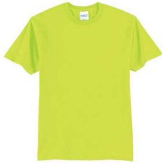
PORT & COMPANY® Core Blend Tee PC55 | PC55T | PC55Y | Adult Sizes: S-6XL | Tall Sizes: LT-4XLT | Youth Sizes: XS-XL