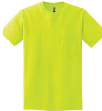
GILDAN® Ultra Cotton® 100% US Cotton T-Shirt with Pocket 2300 | Adult Sizes: S-5XL