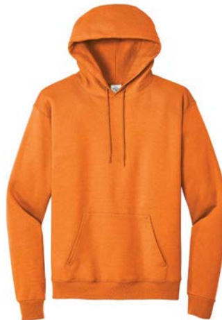
HANES® EcoSmart® Pullover Hooded Sweatshirt P170 | Adult Sizes: S-5XL