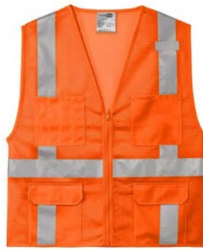
CORNERSTONE® ANSI 107 Class 2 Mesh Six- Pocket Zippered Vest CSV104 | Adult Sizes: S/M, L/XL, 2XL/3XL, 4XL/5XL