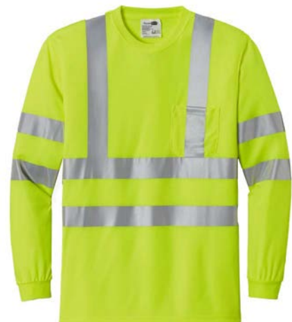
CORNERSTONE® ANSI 107 Class 3 Long Sleeve Snag-Resistant Reflective T-Shirt CS409 | Adult Sizes: XS-4XL