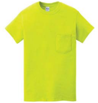
GILDAN® Heavy Cotton™ 100% Cotton Pocket T-Shirt 5300 | Adult Sizes: S-3XL