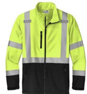
CORNERSTONE® ANSI 107 Class 3 Soft Shell Jacket CSJ503 | Adult Sizes: S-5XL