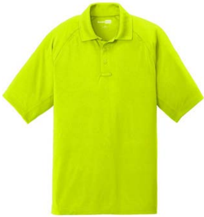
CORNERSTONE® Select Lightweight Snag-Proof Tactical Polo CS420 | Adult Sizes: XS-4XL