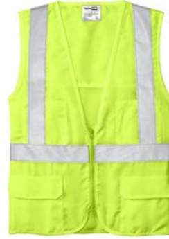
CORNERSTONE® ANSI 107 Class 2 Mesh Back Safety Vest CSV405 | Adult Sizes: S-4XL