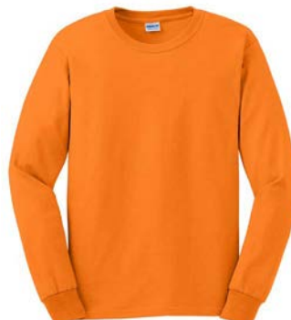
GILDAN® Ultra Cotton® 100% US Cotton Long Sleeve T-Shirt G2400 | Adult Sizes: S-5XL