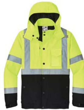
CORNERSTONE® ANSI 107 Class 3 Waterproof Insulated Ripstop Bomber Jacket CSJ501 | Adult Sizes: S-5XL