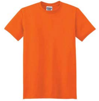
JERZEES® Dri-Power® 100% Polyester T-Shirt 21M | Adult Sizes: S-3XL