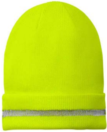
CORNERSTONE® Enhanced Visibility Beanie with Reflective Stripe CS800