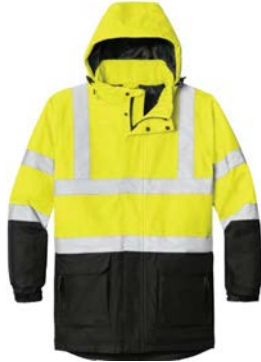
PORT AUTHORITY ANSI 107 Class 3 Safety Heavyweight Parka J799S | Adult Sizes: XS-4XL