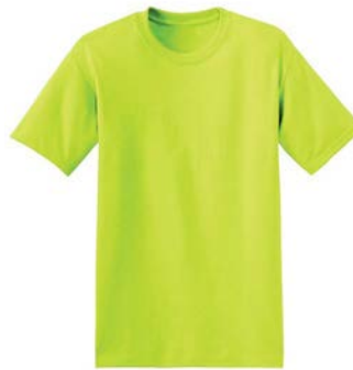
HANES® EcoSmart® 50/50 Cotton/Poly T-Shirt 5170 | Adult Sizes: S-4XL