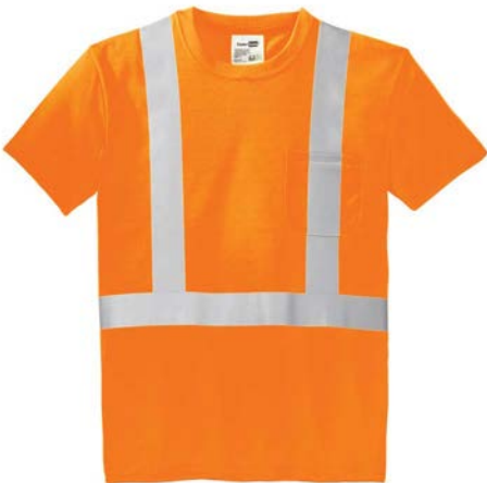
CORNERSTONE® ANSI 107 Class 2 Safety T-Shirt CS401 | Adult Sizes: XS-4XL