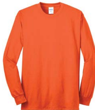
PORT & COMPANY® Long Sleeve Core Blend Tees PC55LS | PC55LST | Adult Sizes: S-6XL | Tall Sizes: LT-4XLT