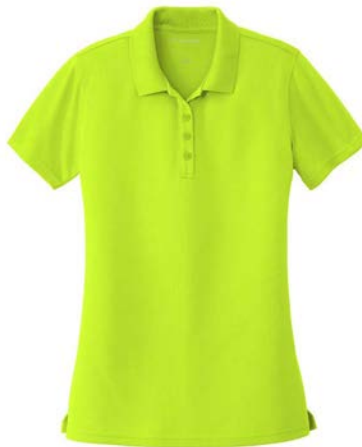
PORT AUTHORITY® Ladies Dry Zone® UV Micro-Mesh Polo LK110 | Adult Sizes: XS-4XL