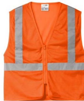
CORNERSTONE® ANSI 107 Class 2 Economy Mesh Zippered Vest CSV101 | Adult Sizes: S/M, L/XL, 2XL/3XL, 4XL/5XL