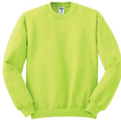
JERZEES® NuBlend® Crewneck Sweatshirt 562M | Adult Sizes: S-4XL