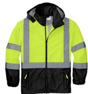
CORNERSTONE® ANSI 107 Class 3 Safety Windbreaker CSJ25 | Adult Sizes: S-4XL