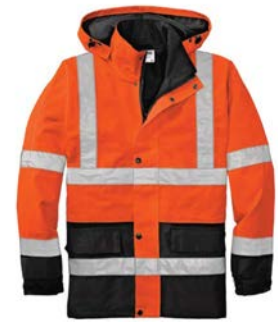
CORNERSTONE® ANSI 107 Class 3 Waterproof Parka CSJ24 | Adult Sizes: S-4XL