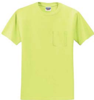
JERZEES® Dri-Power® 50/50 Cotton/Poly Pocket T-Shirt 29MP | Adult Sizes: S-3XL