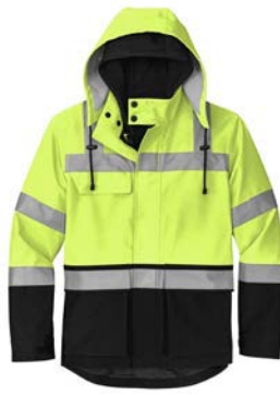
CORNERSTONE® ANSI 107 Class 3 Waterproof Ripstop 3-in-1 Parka CSJ502 | Adult Sizes: S-5XL