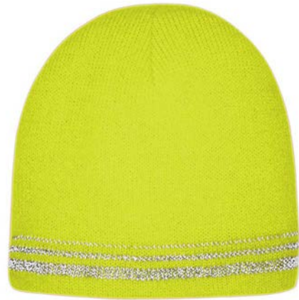
CORNERSTONE® Lined Enhanced Visibility with Reflective Stripes Beanie CS804