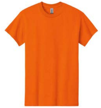
GILDAN® Heavy Cotton™ 100% Cotton T-Shirt 5000 | 5000B | Adult Sizes: S-3XL | Youth Sizes: XS-XL