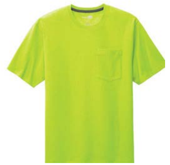
CORNERSTONE® Workwear Pocket Tee CS430 | Adult Sizes: S-4XL