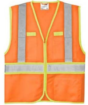
CORNERSTONE® ANSI 107 Class 2 Dual-Color Safety Vest CSV407 | Adult Sizes: S-4XL