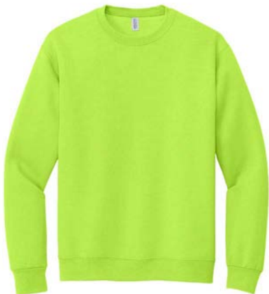
JERZEES® Super Sweats® NuBlend® Crewneck Sweatshirt 4662M | Adult Sizes: S-3XL