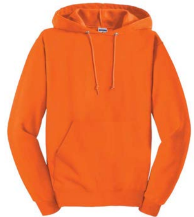
JERZEES® NuBlend® Pullover Hooded Sweatshirt 996M | Adult Sizes: S-4XL