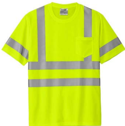
CORNERSTONE® ANSI 107 Class 3 Mesh Tee CS202 | Adult Sizes: M-5XL