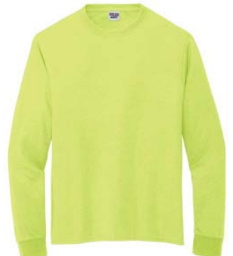
JERZEES® Dri-Power® 100% Polyester Long Sleeve T-Shirt 21LS | Adult Sizes: S-3XL