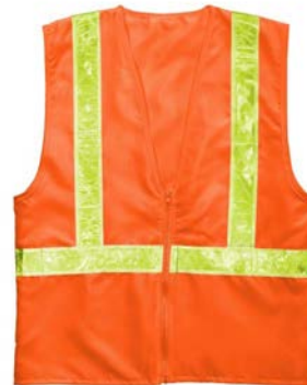
PORT AUTHORITY Enhanced Visibility Vest SV01 | Adult Sizes: S/M, L/XL, 2XL/3XL