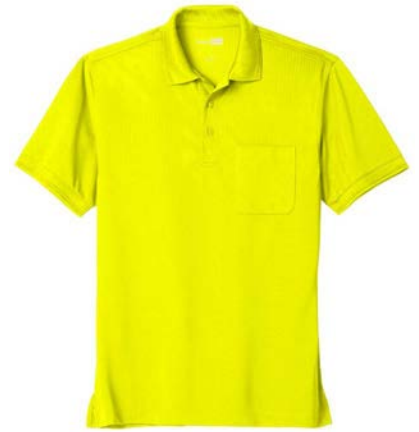
CORNERSTONE® Industrial Snag-Proof Pique Pocket Polo CS4020P | Adult Sizes: XS-6XL