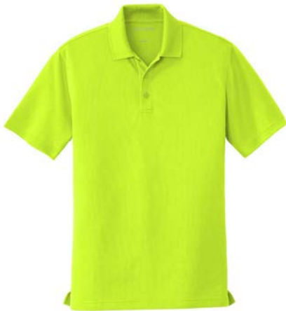
PORT AUTHORITY® Dry Zone® UV Micro-Mesh Polo KT110 | Adult Sizes: XS-6XL