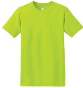
HANES® Essential-T 100% Cotton T-Shirt 5280 | Adult Sizes: S-3XL