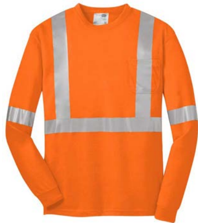
CORNERSTONE® ANSI 107 Class 2 Long Sleeve Safety T-Shirt CS401LS | Adult Sizes: XS-4XL