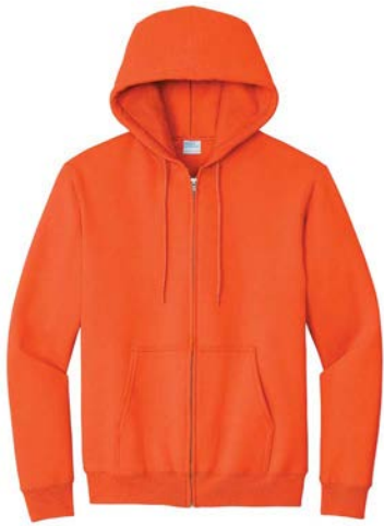
PORT & COMPANY® Essential Fleece Full-Zip Hooded Sweatshirts PC90ZH | PC90ZHT | Adult Sizes: S-4XL Tall Sizes: LT-4XLT