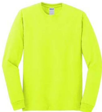
GILDAN® Heavy Cotton™ 100% Cotton Long Sleeve T-Shirt 5400 | Adult Sizes: S-3XL