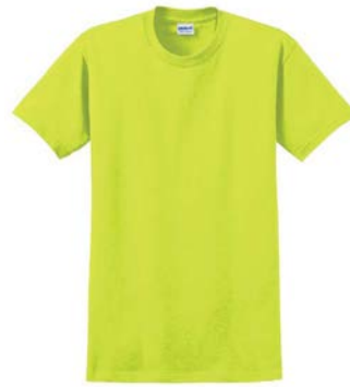
GILDAN® Ultra Cotton® 100% US Cotton T-Shirts 2000 | 2000T | 2000B | Adult Sizes: S-5XL | Tall Sizes: LT-3XLT | Youth Sizes: XS-XL