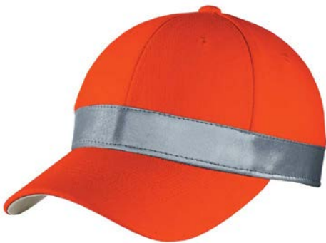
CORNERSTONE® ANSI 107 Safety Cap CS802