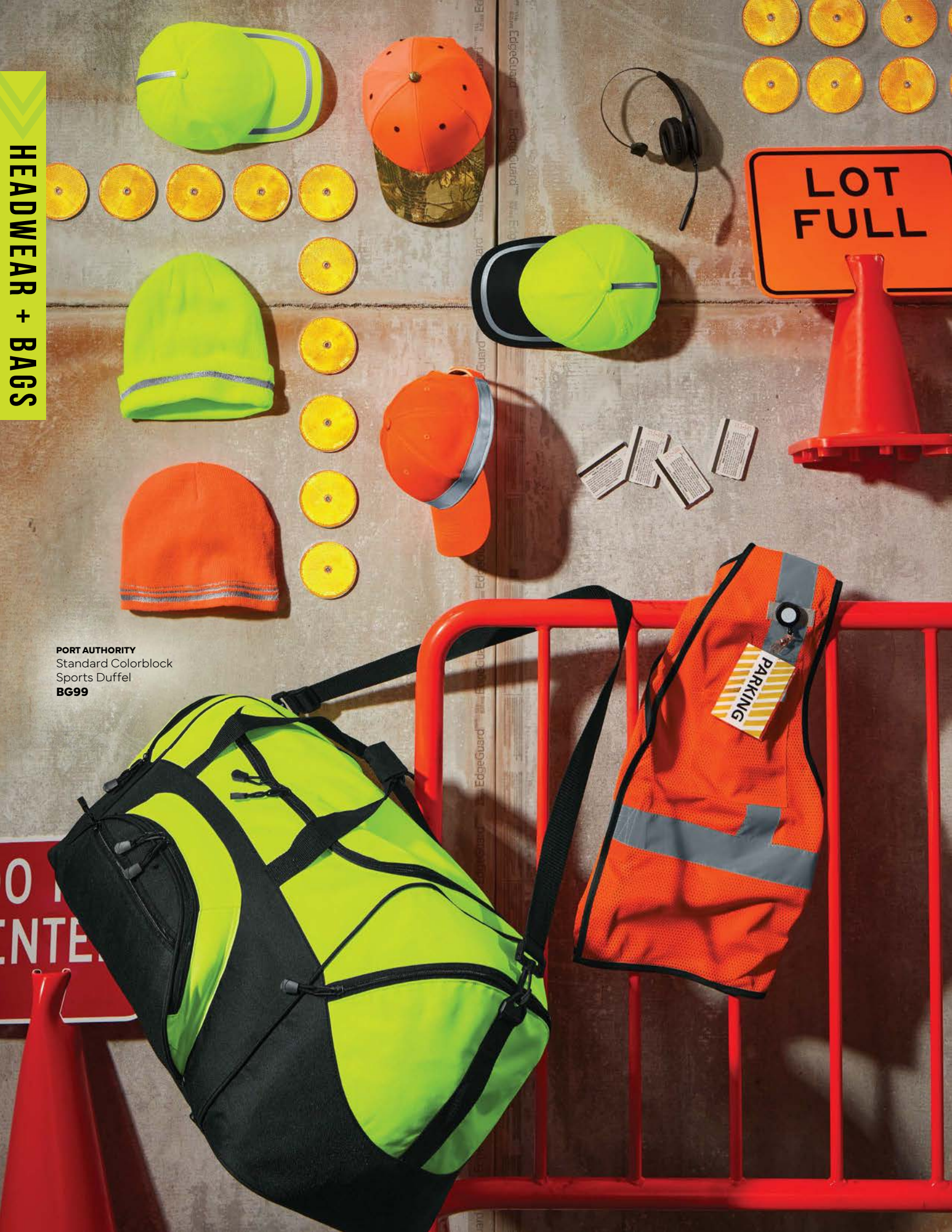
PORT AUTHORITY Standard Colorblock Sports Duffel BG99