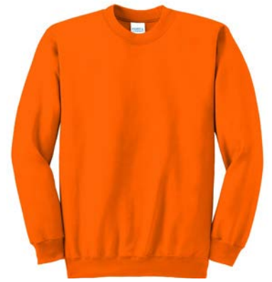
PORT & COMPANY® Essential Fleece Crewneck Sweatshirts PC90 | PC90T | Adult Sizes: S-4XL Tall Sizes: LT-4XLT