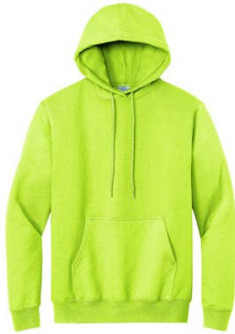
PORT & COMPANY® Essential Fleece Pullover Hooded Sweatshirts PC90H | PC90HT | Adult Sizes: S-4XL Tall Sizes: LT-4XLT