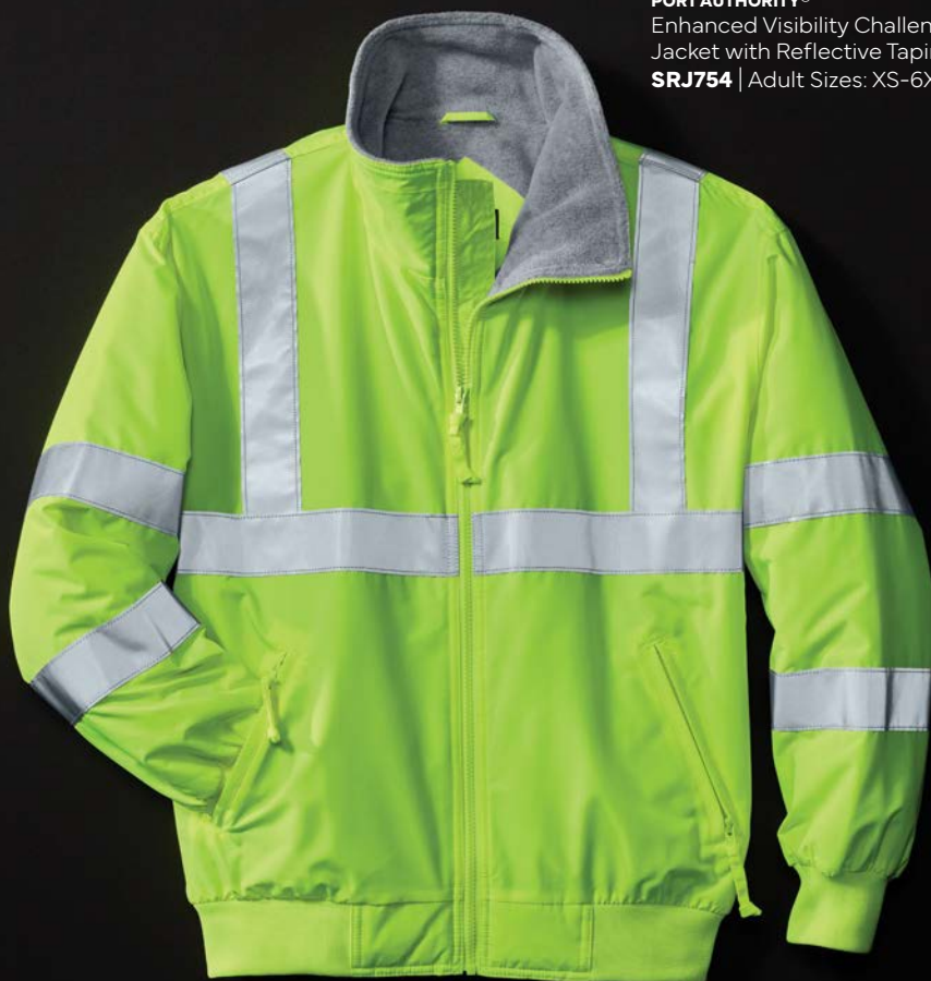
PORT AUTHORITY® Enhanced Visibility Challenger™ Jacket with Reflective Taping SRJ754 | Adult Sizes: XS-6XL