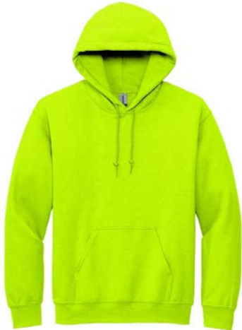
GILDAN® DryBlend® Pullover Hooded Sweatshirt 12500 | Adult Sizes: S-3XL