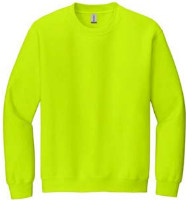
GILDAN® Heavy Blend™ Crewneck Sweatshirt 18000 | Adult Sizes: S-5XL