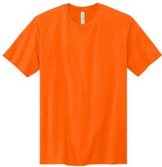
HANES® Cool Dri® Performance T-Shirt 4820 | Adult Sizes: XS-3XL