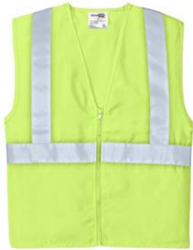
CORNERSTONE® ANSI 107 Class 2 Safety Vest CSV400 | Adult Sizes: S/M, L/ XL, 2XL/3XL