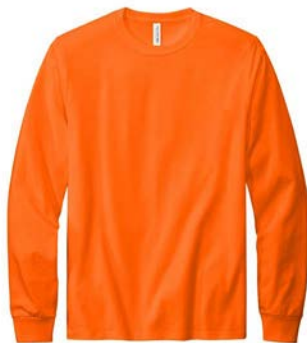
VOLUNTEER KNITWEAR™ All-American Long Sleeve Tee VL100LS | Adult Sizes: S-4XL