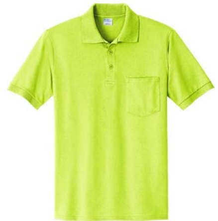
PORT & COMPANY® Core Blend Jersey Knit Polos KP55 | KP55T | Adult Sizes: XS-6XL Tall Sizes: LT-4XLT