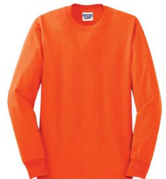
JERZEES® Dri-Power® 50/50 Cotton/ Poly Long Sleeve T-Shirt 29LS | Adult Sizes: S-3XL