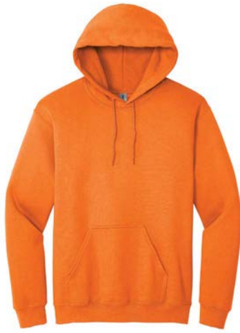
GILDAN® Heavy Blend™ Hooded Sweatshirt 18500 | Adult Sizes: S-5XL