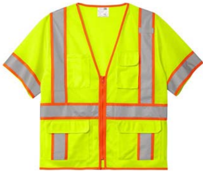
CORNERSTONE® ANSI 107 Class 3 Surveyor Mesh Zippered Two-Tone Short Sleeve Vest CSV106 | Adult Sizes: M-5XL