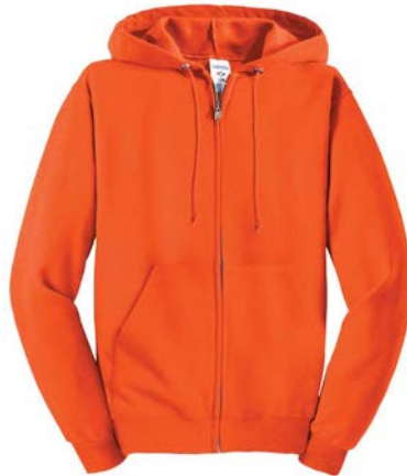
JERZEES® NuBlend® Full-Zip Hooded Sweatshirt 993M | Adult Sizes: S-3XL