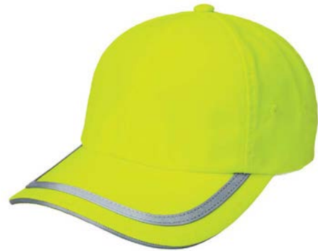
PORT AUTHORITY® Enhanced Visibility Cap C836