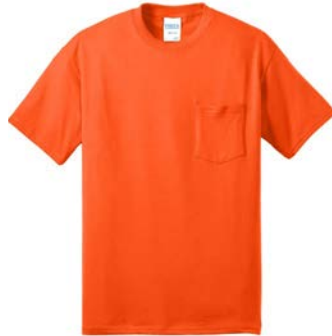
PORT & COMPANY® Core Blend Pocket Tees PC55P | PC55PT Adult Sizes: S-6XL | Tall Sizes LT-4XLT