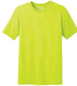
GILDAN Performance® T-Shirt 42000 | Adult Sizes: S-3XL